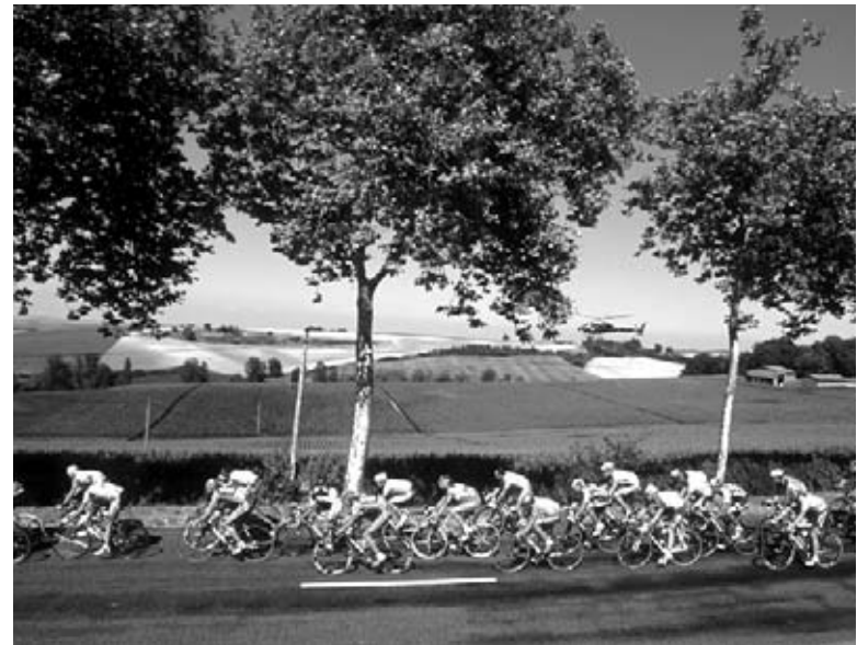
A small part of a Tour de France peloton of over 180 riders races through the French countryside.