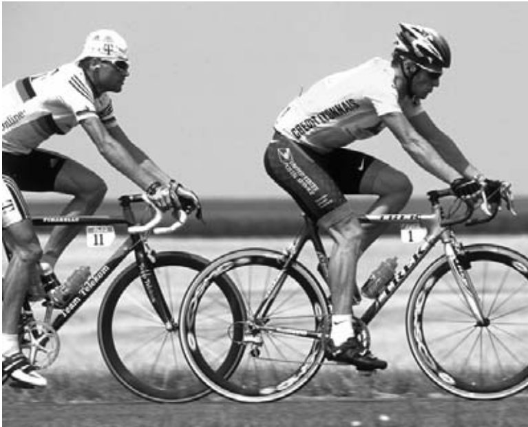
Lance races with second-place finisher Jan Ullrich of Germany, his most serious competitor in the Tour de France.