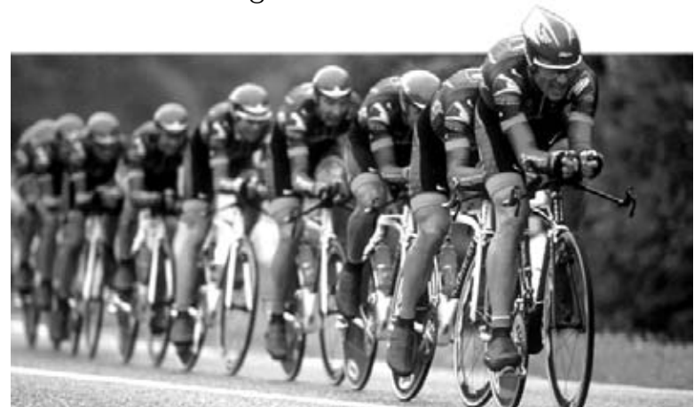
The U.S. Postal Service Team competing in a team time trial