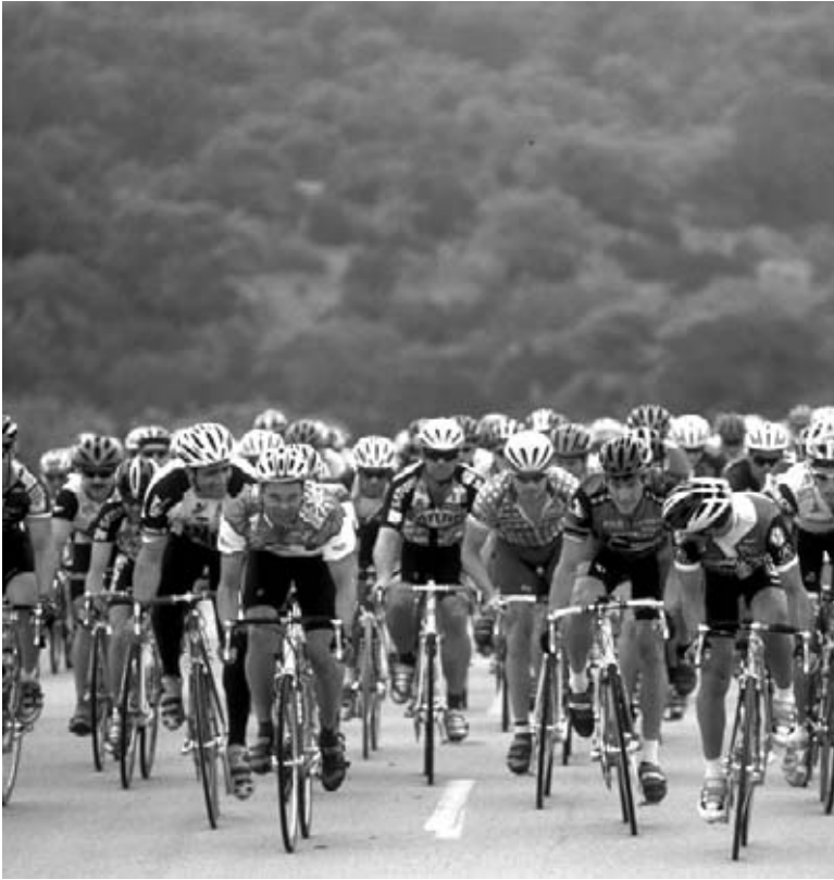
1998 Ride for the Roses