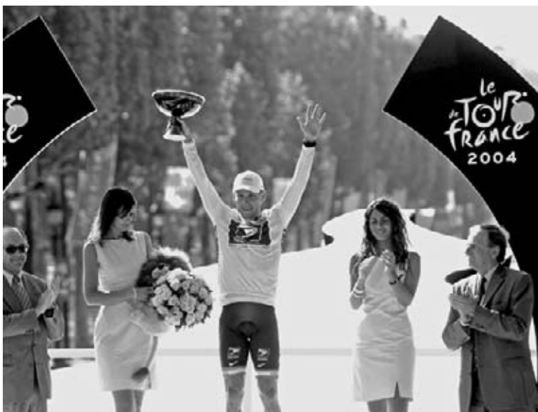
Lance on the victory stand for the 2004 Tour de France.

His mother says he doesn't excel by "sitting on the couch eating potato chips." Lance trains very hard. Eight months before the Tour de France, Lance increases his training routine by pedaling up and down roadsides for more than eight hours a day.