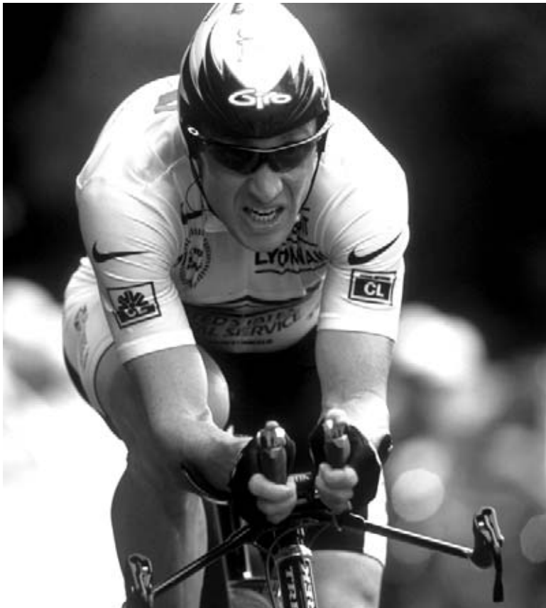
Lance competes in an individual time trial wearing the Tour de France race leader's yellow jersey.

Training, an extraordinary body, and a competitive spirit filled with determination make Lance a very special athlete. Lance has proved that he is not a quitter. When it comes to overcoming the odds, Lance is the best. After all, who would have thought that one man could win seven straight Tour de France victories?