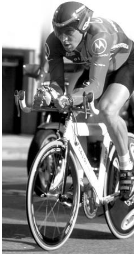
Lance competes in an individual time trial in the 1996 Tour du Pont, a stage race held in the eastern United States.

In 1996, his successes continued. He again won the Tour du Pont and won other important races. He seemed to be on top of the world.