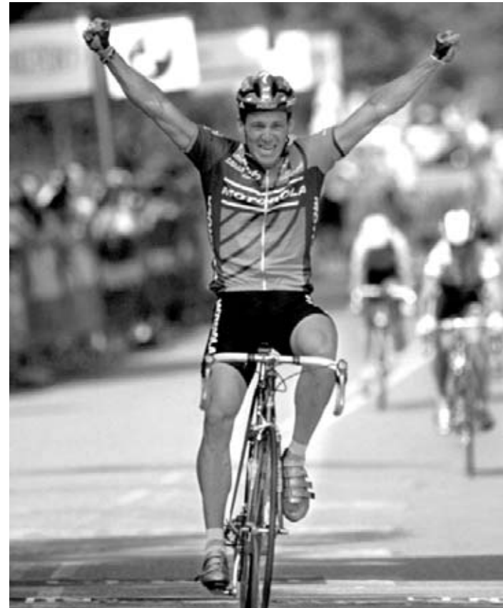
Lance wins his first stage in the Tour du Pont in 1993.