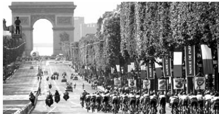
The Tour de France finishes in Paris.

But, for Lance, his ability to excel is about more than hard work. Despite having had cancer, Lance has an extraordinary body. His heart is larger than the hearts of most people. The average heart pumps about five gallons (20 liters) of blood per minute. Lance's heart pumps up to nine gallons (34 liters). His lung capacity is twice that of the average person, meaning that he can send twice the amount of oxygen to his body's cells than you or I can. He also has more red blood cells than the average person. Red blood cells carry oxygen to other cells in the body. These cells use oxygen to burn food and make energy. Lance's muscles are also special. They do not tire as fast as the average person's muscles. He can exercise longer and recover more quickly than most athletes.