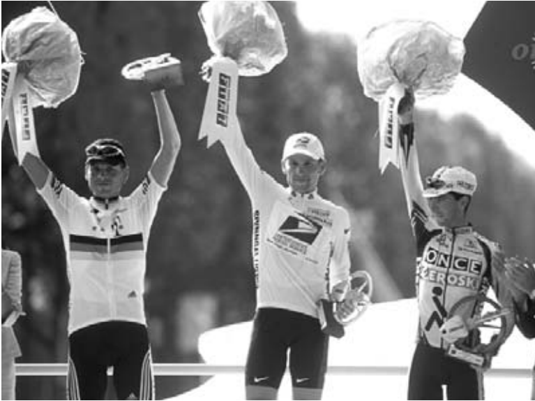
The top three finishers in the 2001 Tour de France share the podium: 2nd place Jan Ullrich (Germany); 1st place Lance Armstrong (United States); and 3rd place Joseba Beloki (Spain).